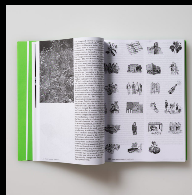
Curatorial Design: A Place Between Dubravka Sekulić