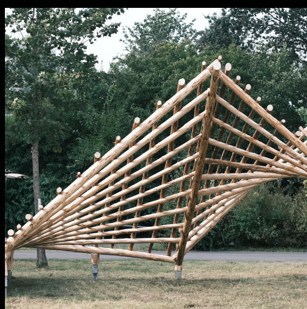
Round Timber in Construction Lukas Kirschnick